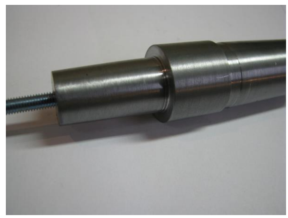
Uwe Burghaus (LatheCity)

Fargo, North Dakota, USA <a href="www.LatheCity.com">www.LatheCity.com</a> <a href="mailto:sales@lathecity.com">sales@lathecity.com</a>