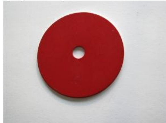
Fig.: Red or black hand wheels on request (metal paint).