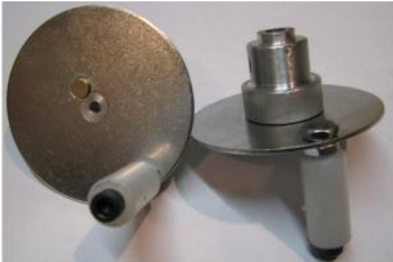
Fig.: Front and back side of the hand wheels.